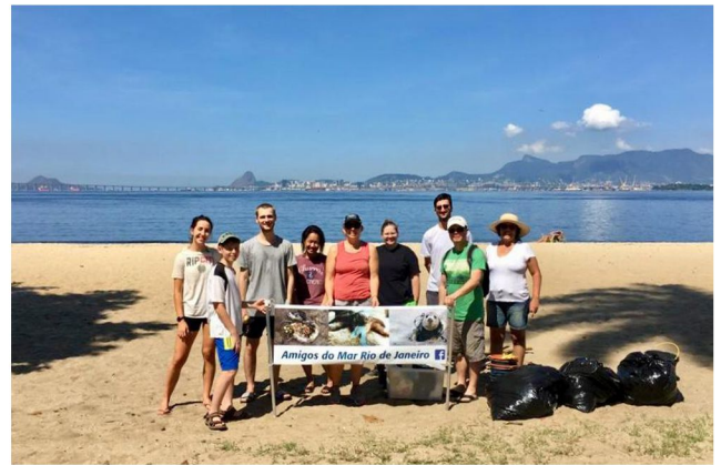
Volunteers from Amigos do Mar RJ

In partnership with “Amigos do Mar RJ” we organized several beach clean-ups during 2019. It was awesome to see the Caminhos Portuguese students, our Mais Caminhos volunteers, and our kids working together on such a great task! The Kids had fun, worked hard and were also invited to think about the impact of our actions on our oceans.