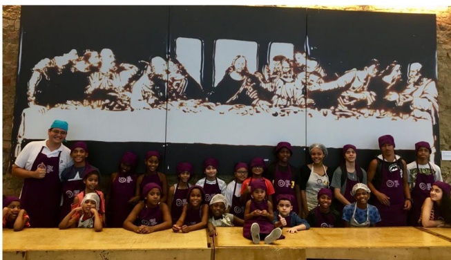
Kids and Volunteers visiting Gastromotiva for cooking lessons.