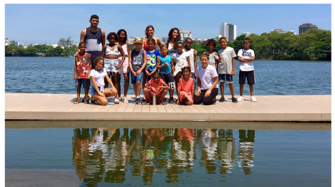
Kids enjoying themselves at Lagoa during the summer camp.