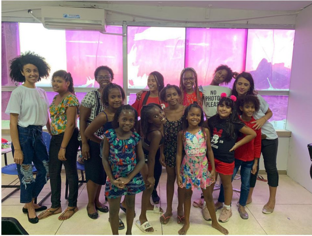
Kids on their beauty day at the winter camp with our friends from Clube das Pretas