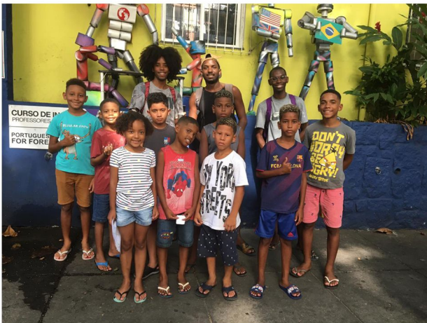
Kids on their beauty day at the winter camp.