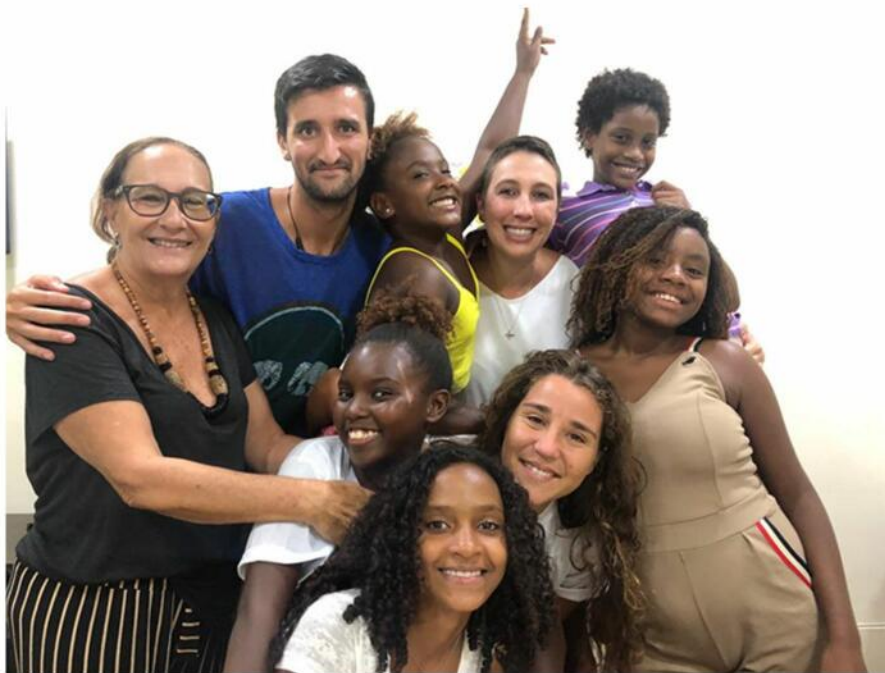
A few volunteers with some of the children from Mais Caminhos.