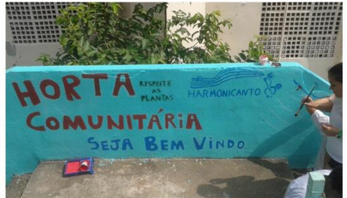
New garden at Cantagalo community.

We know how important it is to take care of our environment and raise awareness about taking care of our public spaces. Together with Harmonicanto, a partner organization where some of our students attend music lessons. We helped them build a fruits and vegetables garden and to paint and clean some public areas of the favela. This mobilization involved over 20 volunteers.