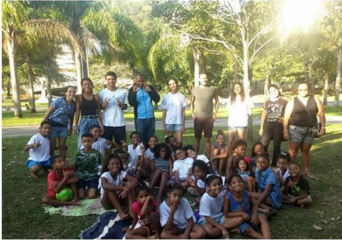
Kids at Lagoa at the end of the Winter Program.

During the month of July, we hosted our now traditional Winter Program. It has the same structure as the Summer Program except it runs for a shorter period. We provide a fun and safe environment for the kids during their school winter recess. It is a good way to keep contact and strengthen our relationship with the community and kids.