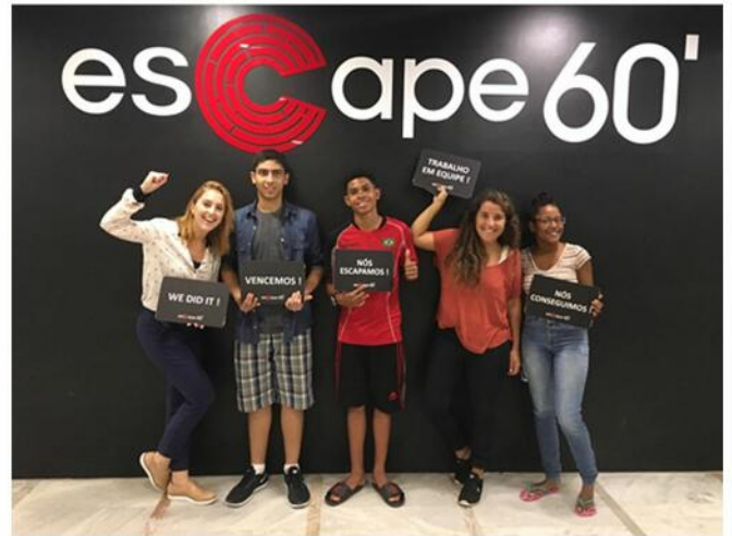
Kids celebrating their success at the enigma room.