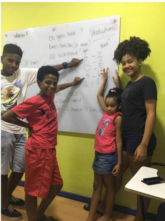
Kids doing predictions about the results of FIFA World Cup.