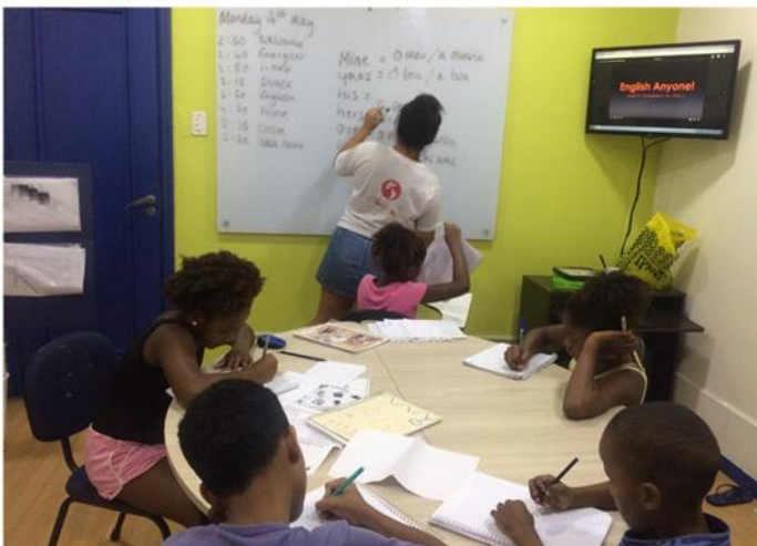
Students learning English at the Complementary Education Program

Three times a week children aged 8 to 11 take over the classrooms and participate in three hour classes. Since we want to develop our children's academic and life skills to the fullest, we focus on teaching the same group of children for a lengthy period of time. Mais Caminhos believes that the right balance of academic and emotional development with creative and physical inputs is a great way to prepare our children for their future, that we try to make a little brighter. Our international volunteers give their best to teach the children and help pave the path to a better life.