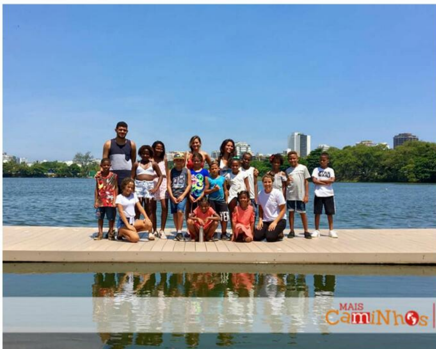
Volunteers with kids at Lagoa.

We will continue with the family support and intend to be able to offer scholarships to new students.