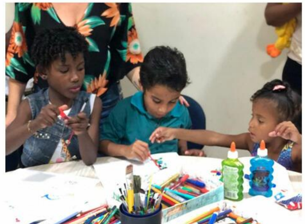
Kids and families we gifted during the Christmas campaign.