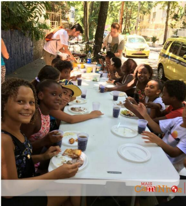
Kids of Mais Caminhos having lunch in front of the school.

Finally, thanks to our students and families of the project. Thanks for trusting us and for believing in our work. Thanks for all the help you've offered during the year and for the support. Thanks for the trust and patience and all the kind words of encouragement.