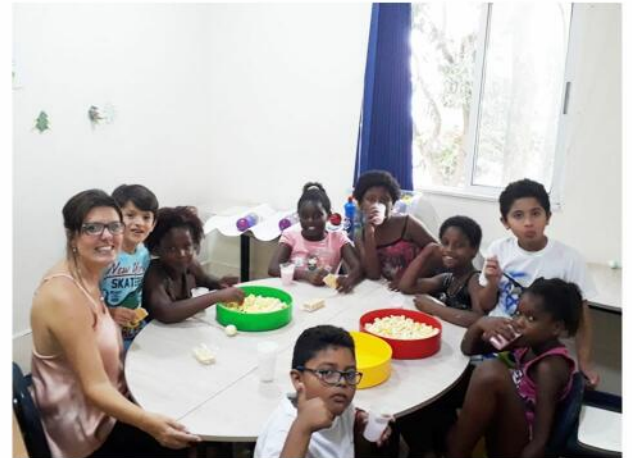
Kids having a snack with the teacher.