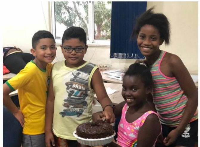
Birthday celebration at the CEP

During 2018 we made the decision to change our group of kids and lower the maximum age for admission to this program. In the favelas children mature at a young age, so this year we decided to lower the maximum age for the kids of our program from 12 to 11 years-old, making the new age range of our students 8 to 11.