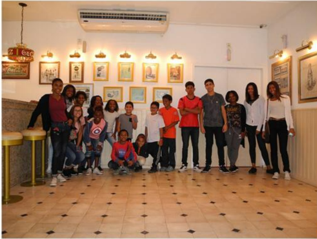
Students visiting the Coca-Cola Company.