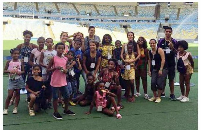
Kids and volunteers of Mais Caminhos visiting the Maracanã Stadium